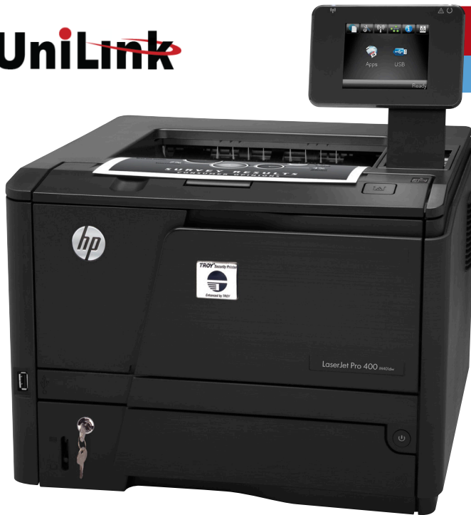
401DN Model Shown